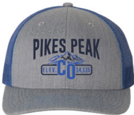
RICHARDSON - SNAPBACK TRUCKER CAP - 112 HEATHER GREY/ ROYAL