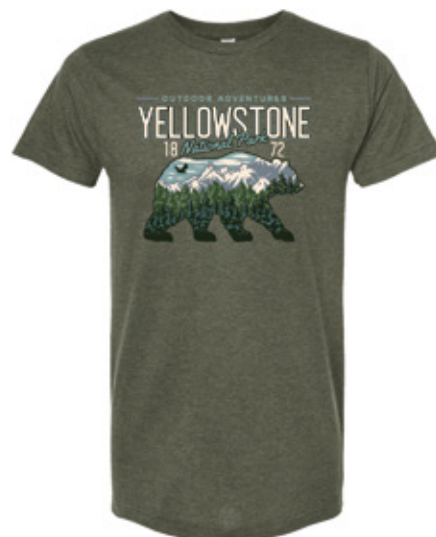
TULTEX - UNISEX FINE JERSEY T-SHIRT - 202 HEATHER MILITARY GREEN