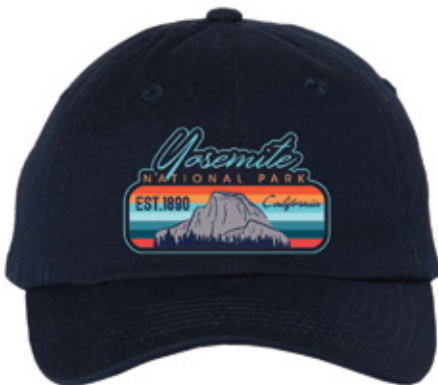
VALUCAP - SMALL FIT BIO-WASHED DAD HAT - VC300Y NAVY