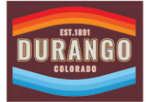
DESIGN # VINTAGE 21 | 3 COLOR ART