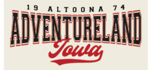
DESIGN # SEC018 | 3 COLOR ART