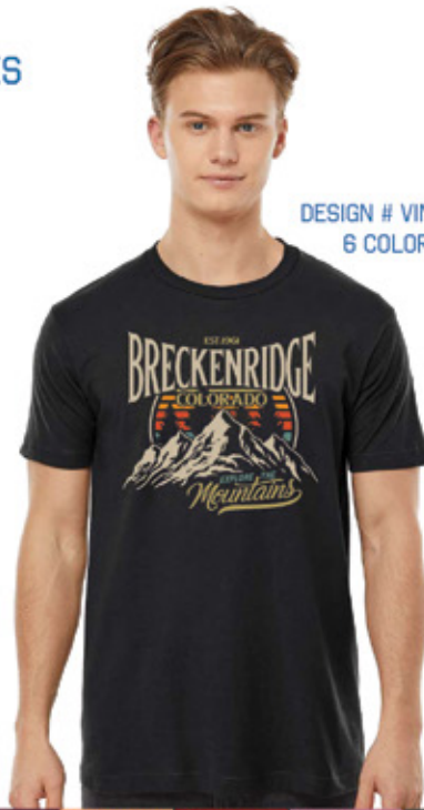
DESIGN # VINTAGE 44 6 COLOR ART