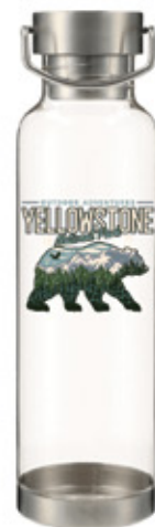
1628-56 - CLEAR THOR TRITAN SPORT BOTTLE 27OZ