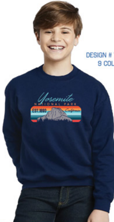
DESIGN # VINTAGE 85 9 COLOR ART