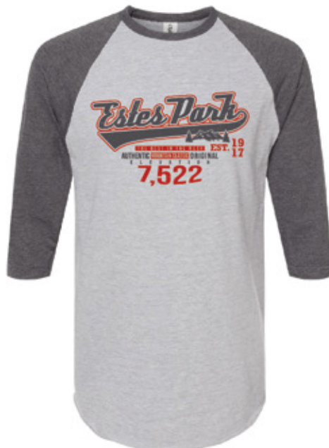
TULTEX - UNISEX FINE JERSEY RAGLAN T-SHIRT - 245 HEATHER GREY/ HEATHER CHARCOAL