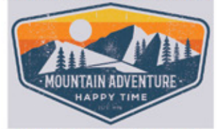
DESIGN # SEC060 - 7 COLOR ART