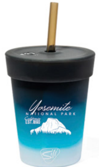
KIDS SILICONE TUMBLERS - 8 OZ MOON BEAM