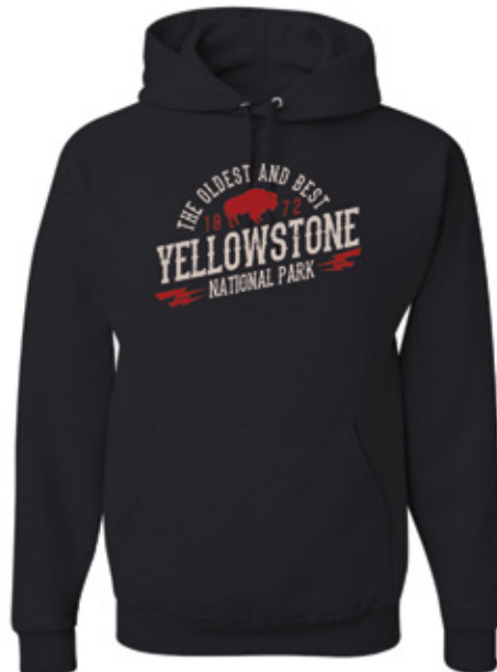
JERZEES - NUBLEND® HOODED SWEATSHIRT - 996MR BLACK