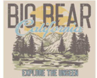
DESIGN # VINTAGE 108 | 4 COLOR ART