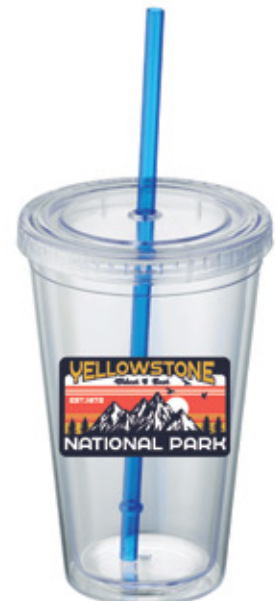
1622-63 - CLEAR SEDICI TUMBLER 16OZ