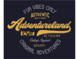
DESIGN # SEC059 | 7 COLOR ART