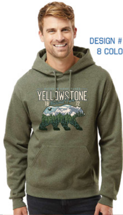
DESIGN # SEC019 8 COLOR ART