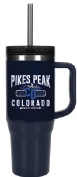
SM-6948 - NAVY THOR 40 OZ ECO-FRIENDLY STRAW TUMBLER