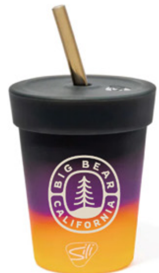
KIDS COLLECTION SILICONE TUMBLERS - 8 OZ SUN STORM