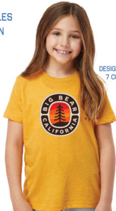
DESIGN # SEC046 7 COLOR ART