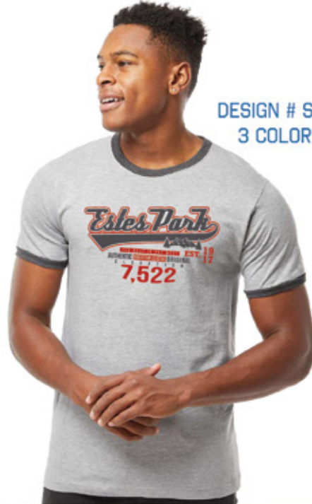
DESIGN # SEC003 3 COLOR ART