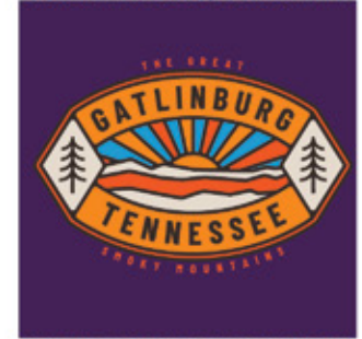
DESIGN # SEC057 | 6 COLOR ART