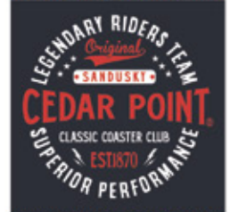
DESIGN # VINTAGE 27 | 3 COLOR ART