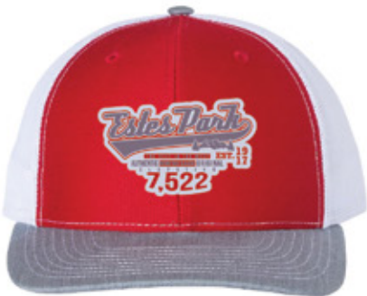
RICHARDSON - SNAPBACK TRUCKER CAP - 112 RED/ WHITE/ HEATHER GREY