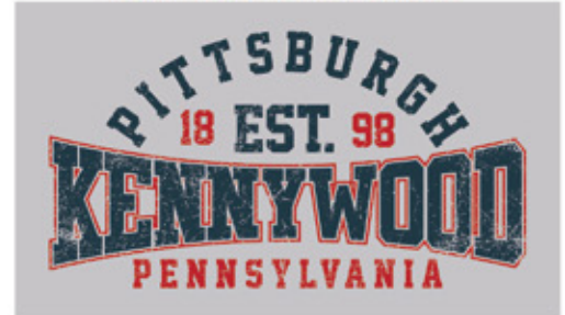
DESIGN # SEC028 | 3 COLOR ART