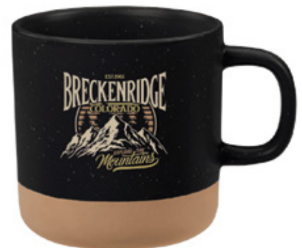
SM-6355 - BLACK SANTOS ARTISANAL 12OZ CERAMIC COFFEE MUG