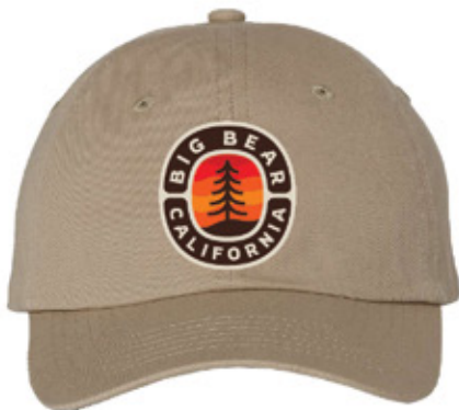
VALUCAP - SMALL FIT BIO-WASHED DAD HAT - VC300Y KHAKI