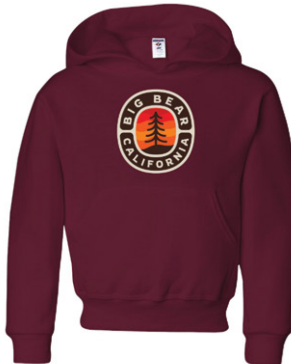
JERZEES - NUBLEND® YOUTH HOODED SWEATSHIRT - 996YR MAROON