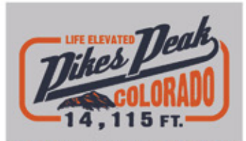
DESIGN # VINTAGE 42 | 3 COLOR ART