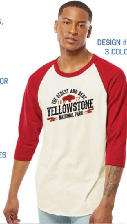
DESIGN # SEC022 3 COLOR ART