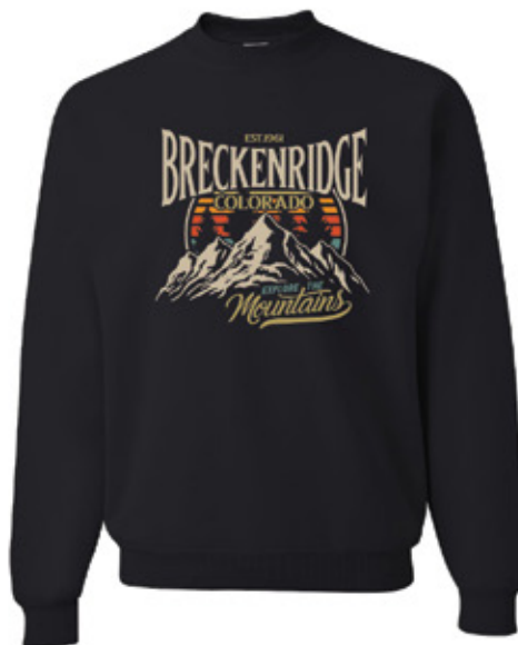
JERZEES - NUBLEND® CREWNECK SWEATSHIRT - 562MR BLACK