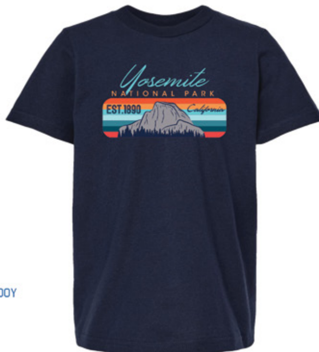
TULTEX - YOUTH FINE JERSEY T-SHIRT - 235 NAVY