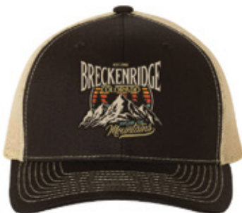
RICHARDSON - SNAPBACK TRUCKER CAP - 112 BLACK/ VEGAS GOLD