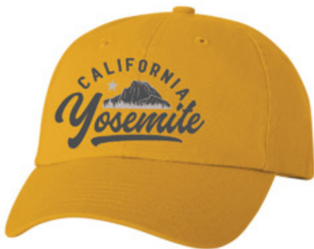
VALUCAP - ADULT BIO-WASHED CLASSIC DAD HAT - VC300A GOLD