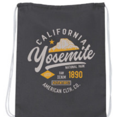
Q-TEES - ECONOMICAL SPORT PACK - Q4500 CHARCOAL