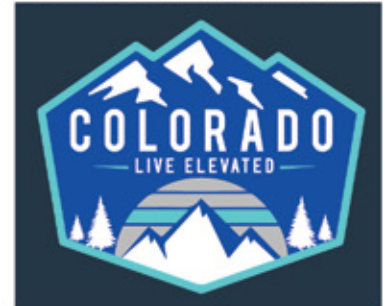
DESIGN # SEC016 | 3 COLOR ART