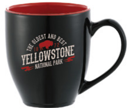
SM-6336 - ZAPATA 150Z CERAMIC MUG ELECTRIC BLACK / RED