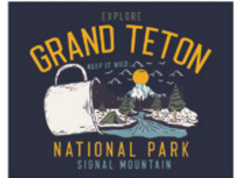
DESIGN # SEC 011 | 5 COLOR ART