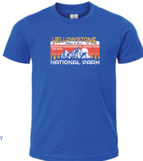
TULTEX - YOUTH FINE JERSEY T-SHIRT - 235 ROYAL