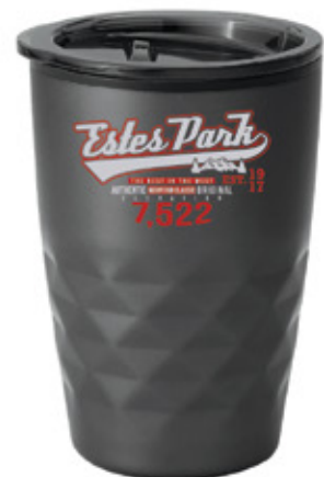
SM-6926 - CHAR KAPPA DOUBLE-WALL INSULATED 12 OZ TUMBLER