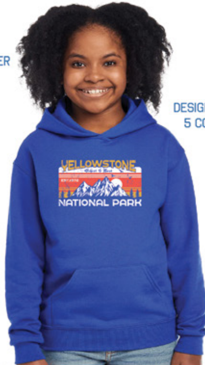
DESIGN # SEC041 5 COLOR ART