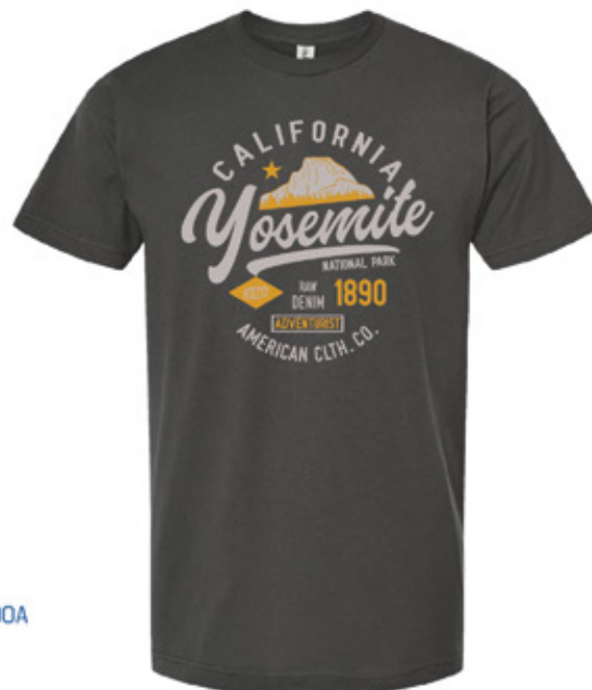
TULTEX - UNISEX FINE JERSEY T-SHIRT - 202 CHARCOAL