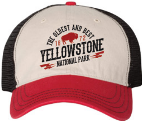
RICHARDSON - GARMENT-WASHED TRUCKER CAP - 111 STONE/ BLACK/ RED