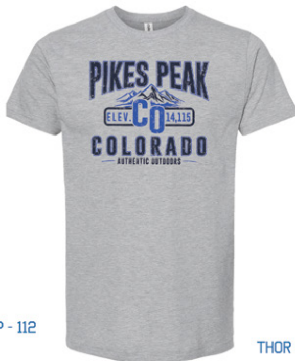
TULTEX - UNISEX FINE JERSEY T-SHIRT - 202 HEATHER GREY