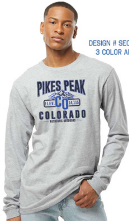
DESIGN # SEC004 3 COLOR ART