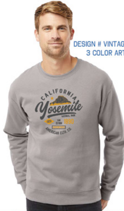
DESIGN # VINTAGE 24 3 COLOR ART